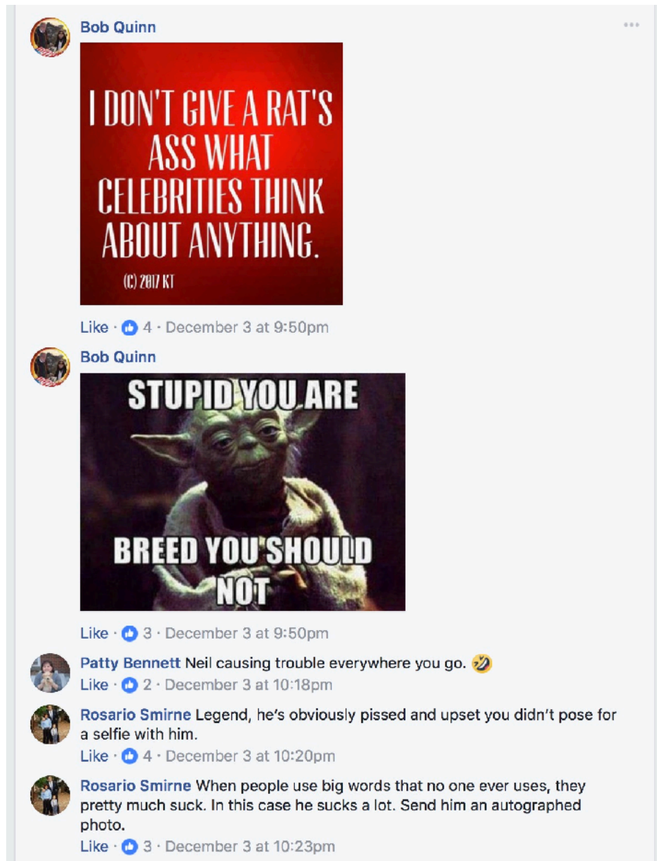
Figure 3 - Extremely rude

The posts which Chatterjee “liked” included “memes” running from the mildly rude to down right offensive - see figures 2-4.