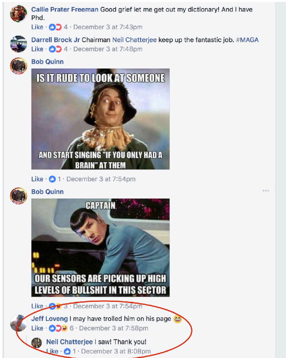
Figure 3 - Downright offensive

By “liking” these images and snarky comments, Chairman Chatterjee shows beyond a shadow of a doubt that he is not an impartial arbiter, and cannot be trusted to make fair and impartial rulings before FERC. In this case, the background of James Cromwell being an actor seems to carry far more weight with Mr. Chatterjee than the substance of Mr. Cromwell’s words and protests on a matter before FERC.