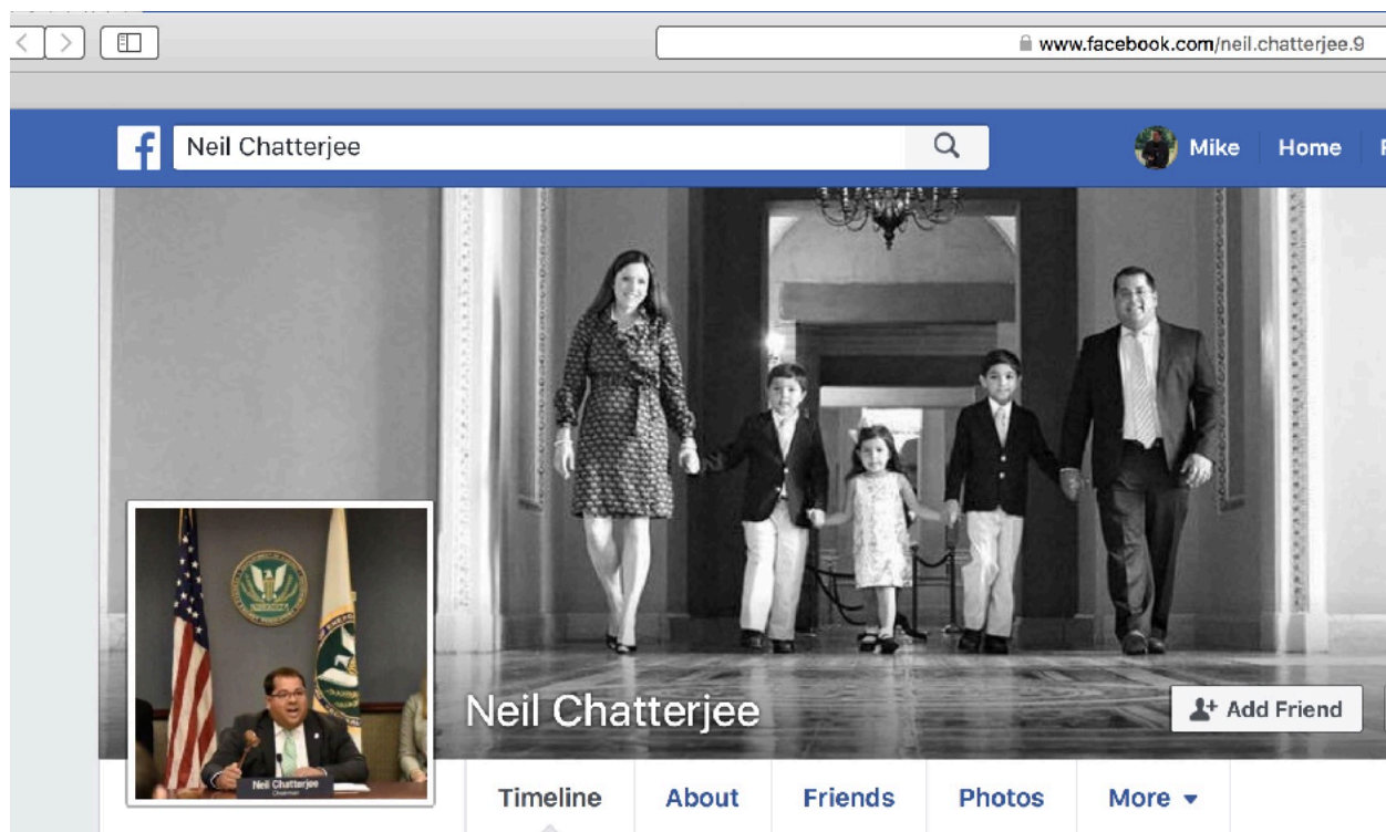
Figure 1 - Neil Chatterjee's web page

under the FERC seal and next to the flag of the United States of America, holding a gavel over his name plate declaring him Chairman of FERC 3 . See Figure 1.